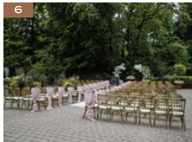
1: Angel Photography. 2 & 5: Hemera Visuals. 3 & 4: Kris Dickson Photography. 6: Steven Hanna Photography.