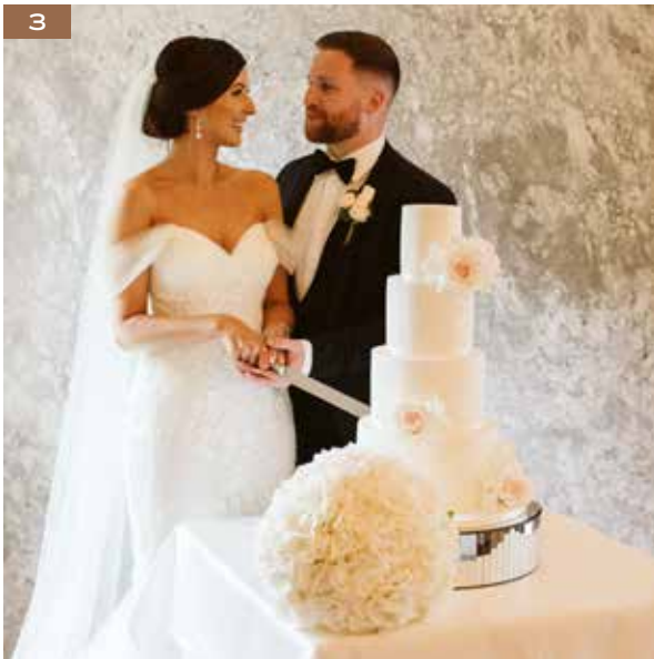
1 - 3: Emma Rock Photography.