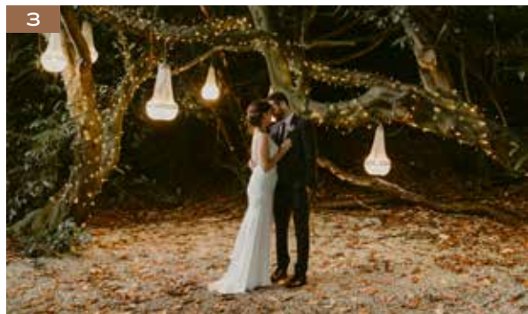
1: Emma Rock Photography. 2: Jayne Harkness Photography. 3: Adam & Grace Photography.