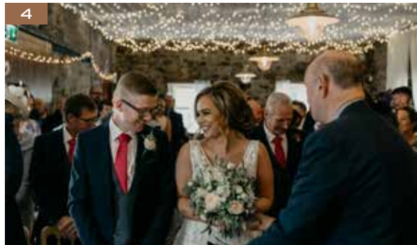
1: Steven Hanna Photography. 2 & 3: Steven Neeson Photography. 4: Mark Barnes Photography.