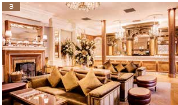
1 & 2: Kris Dickson Photography. 3: Chris Heaney Photography.