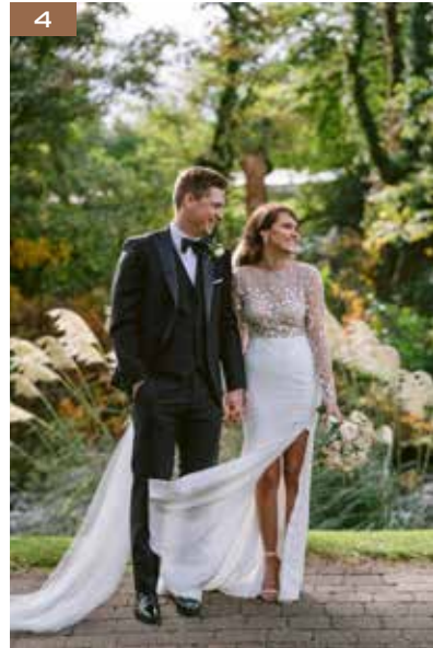
1 & 2: Jayne Lindsay Photography. 3: Alexandra Barfoot Photography. 4: Ali & Laura Photography. 5: Francis Meaney Photography.