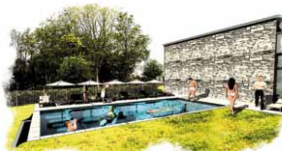
VISUAL OF OUTDOOR JACUZZI POOL

GALGORM RESORT & SPA 136 FENAGHY ROAD GALGORM CO. ANTRIM NORTHERN IRELAND BT42 1EA