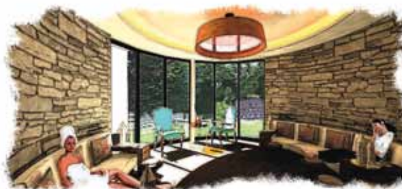
VISUAL OF RIVER VIEW RELAXATION ZONE

Luxury Manicure & Pedicure Suite with a River View Extended Reception area featuring Guest Liaison Juice Bar and Retail Outlet Additional “duo” treatment room Outdoor Jacuzzi Pool River View Relaxation zone