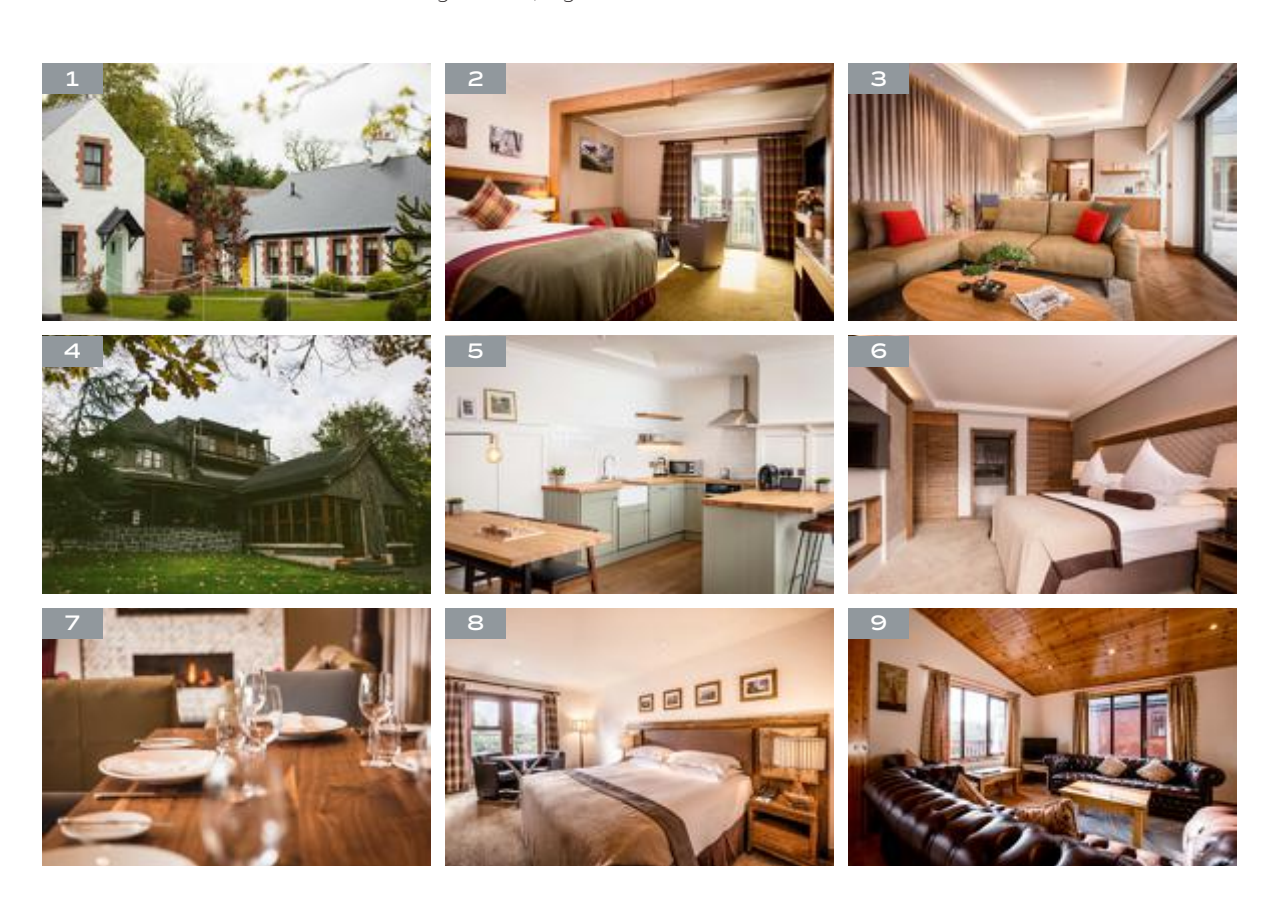
1. Cottage Suites. 2. Deluxe Room. 3. Signature Suite. 4. Red Oaks Residence. 5. Cottage Suite. 6. Suite. 7. Signature Suite. 8. Superior Room. 9. Log Cabin.

Accommodation to suit all tastes with a range of luxury guestrooms, cottage suites, log cabins & Red Oaks Residence.