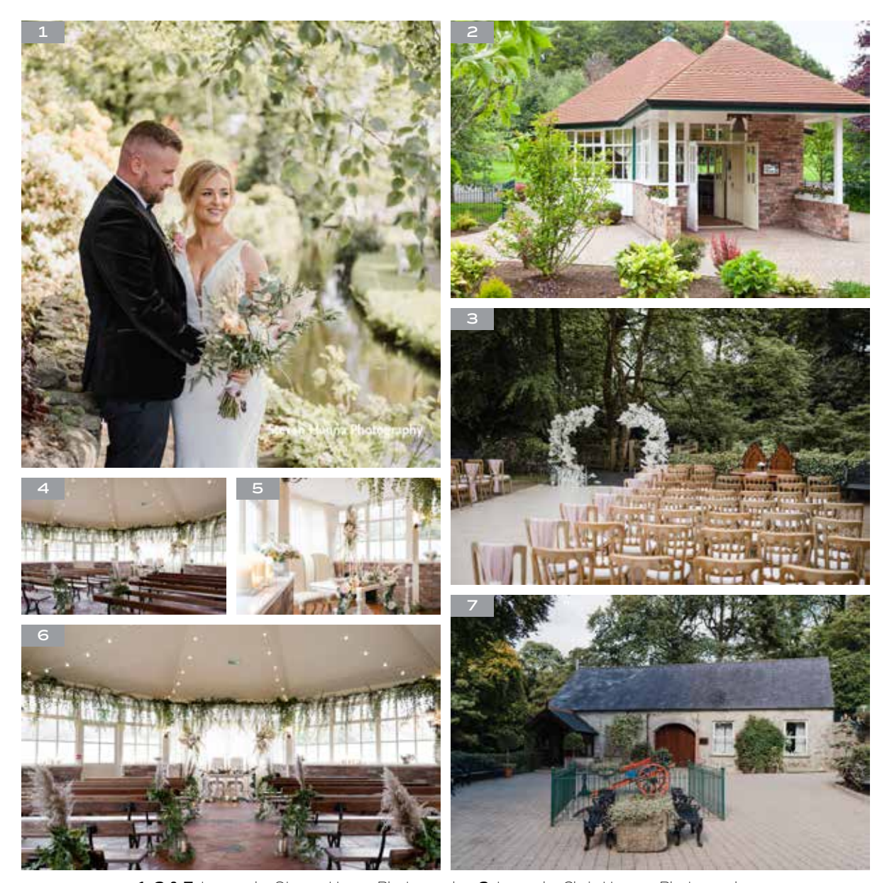
1, 3 & 7: Images by Steven Hanna Photography. 2: Image by Chris Heaney Photography. 4, 5 & 6: Images by Alexandra Barfoot Photography.