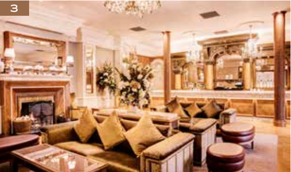
1 & 2: Kris Dickson Photography. 3: Chris Heaney Photography.