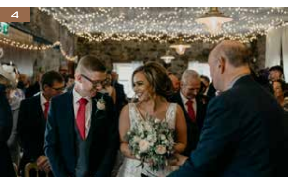
1: Steven Hanna Photography. 2 & 3: Steven Neeson Photography. 4: Mark Barnes Photography.