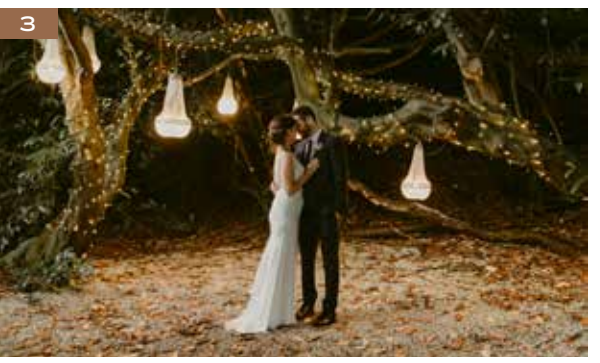
1: Emma Rock Photography. 2: Jayne Harkness Photography. 3: Adam & Grace Photography.