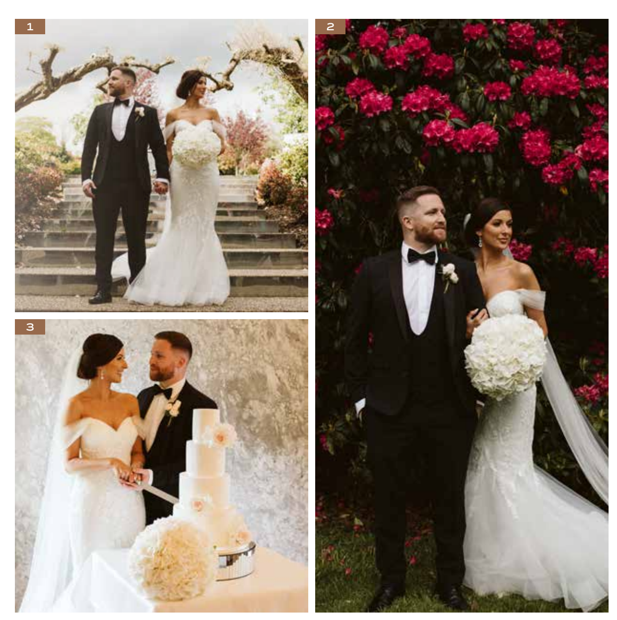
1 - 3: Emma Rock Photography.