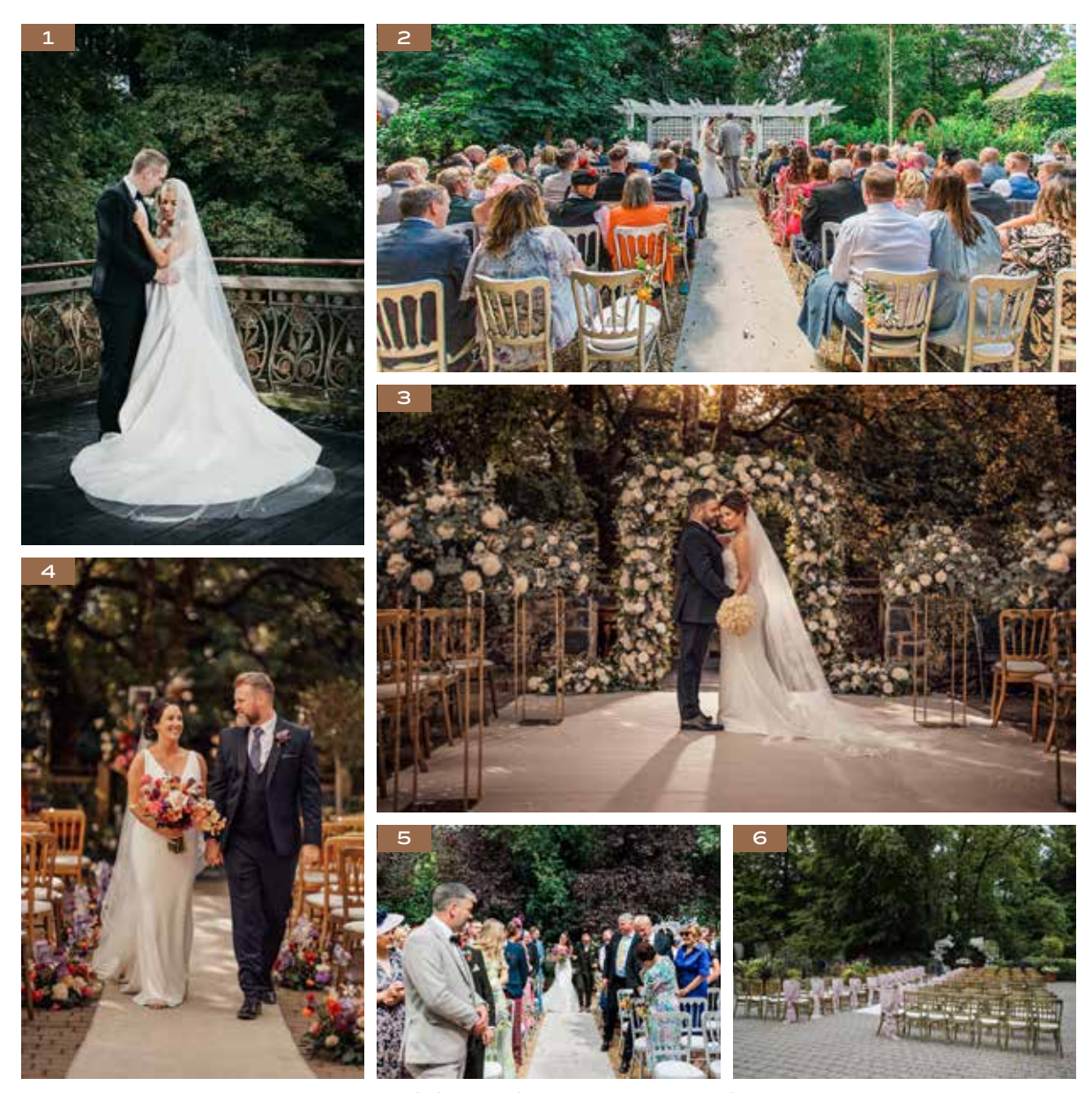
1: Angel Photography. 2 & 5: Hemera Visuals. 3 & 4: Kris Dickson Photography. 6: Steven Hanna Photography.