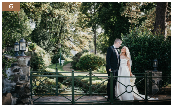
1 & 4: Photography by Steven Hanna. 2,3 & 5: Photography by Alexandra Barfoot. 6: Photography by Angel Photography.